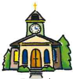
Pastor's Office Hours

Monday - 9am-12pm Wednesday - 9am-12pm Thursday - 9am - 12pm Friday - 9am - 12pm